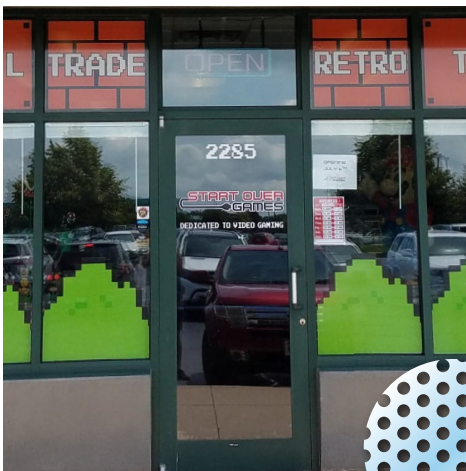
Hole Size: 1.5mm - Perf Ratio of 40%

The 60/40% perforation pattern allows for the maximum print surface, making it ideal for all retail exterior-mount window graphics requiring small detail and text. Clear adhesive, removable up to one year. The dual perforated paper liner protects printer beds.